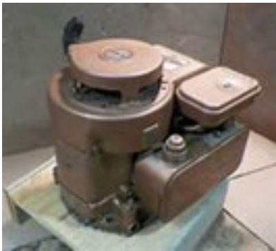
Briggs and Stratton Lawnmower Engine

My first exposure to an air cooled engine was mowing lawns. Those old Briggs and Stratton (and other) engines dumped their waste heat to the atmosphere using air. When our family lawnmower was behaving badly, I remember taking it apart and noticing the cylinder cooling fins and the vanes on the blower/flywheel. When I put it back together (only a few extra parts were left), it actually ran. It made hot air (and noise).