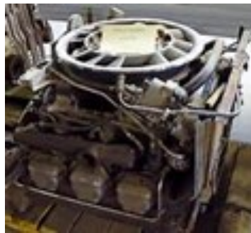
Air Cooled Tank Engine

A most interesting application was air cooled tank engines. Think about it. If the engine were air cooled, the need for all of the indirect heat exchange equipment could be avoided. Ambient conditions would have less effect. Freezing and other related issues could be reduced if not eliminated. Spare parts could be reduced. I happened upon the following photo of reportedly an air cooled tank engine. Ed Cole of Corvair fame was once involved with the design and application of air cooling for tanks.