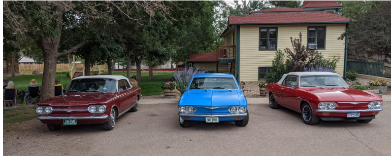
Russerts '64 convertible, Peavyhouse's '65 2-door coupe (at it's first meeting!), Mike Piper's '65 convertible

After four months of zoom meetings it was fantastic to see everyone who was able to attend our July meeting on Sunday! We met at Palmer Lake park, where we set up our own chairs, and made sure we were masked and appropriately socially distant.