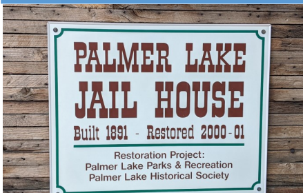
No one ended up here, though Mike did drive a little fast to be on time!