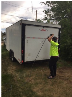
Charlie Beets Power Washing Trailer Ramp Exterior

The focus was mainly on the exterior of the back deck (ramp). This is what folks following the trailer see and what is first noticed by event attendees when SeeMore arrives. The outside had been spattered with concrete spray. The team scrapped most of that spatter away. The lower damaged DOT 2 marking tape was removed and the adhesive was Goof Off’ed. The panels were power washed and sanded and, after masking, Rick painted the cleaned surfaces white as original. Silicone sealant is ready to be applied to replace the old sealant that was removed.