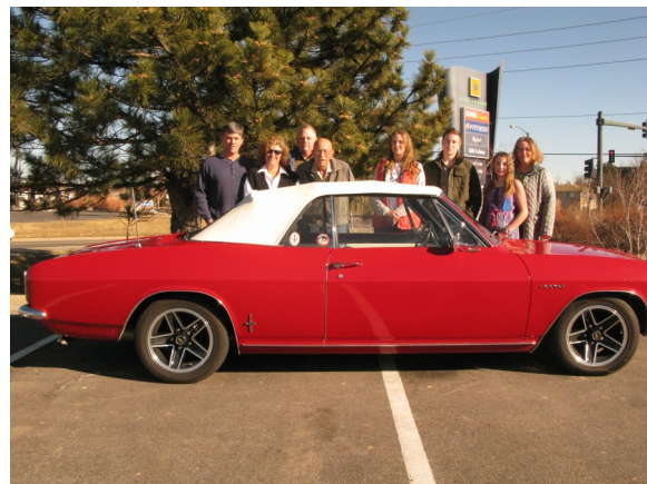
Four generations of Corvair owners/drivers. My dad, me, my brother (our wives both were passengers), my oldest daughter and my grandson and granddaughter. My daughter and grandson have both driven Corvairs. My grandson even drove to a Corsa convention in Independence MO and two Tri-States.

His last Corvair driving experience was several years ago when I loaned him my '66 convertible with the 140 PG in it. He drove it for a week and really enjoyed the throw back experience. I did need to remind him once it didn't have power brakes, so you had to get on the brakes early. It was always hard to correct your dad.