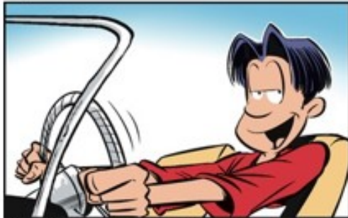
© 2020 Baldo Partnership/Dist. by Andrews McMeel Syndication