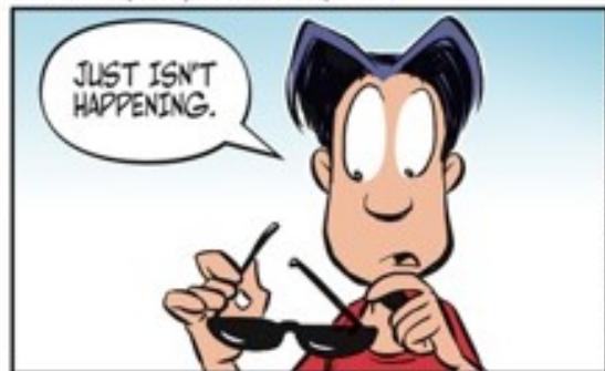
www.facebook.com/BaldoComics • www.BaldoComics.com/Baldo