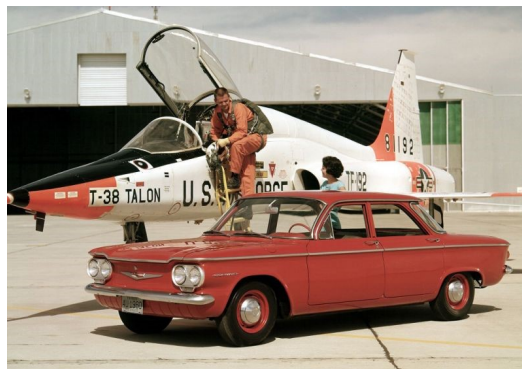
Corvair Vindication Day is Coming