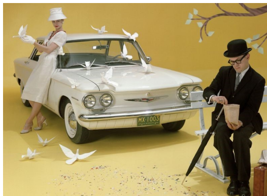
Corvair Vindication Day is Coming

Many people still believe the Chevy Corvair is a fundamentally dangerous car thanks to a faulty design. By having the display pulled from the museum, Gigante feels like misconceptions would not be perpetuated.