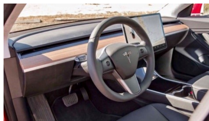
Dash Panel Provides Convenient Access to Most Doohickeys

Inside, there is no “dashboard” in the conventional sense but may become the new conventional sense. Instead there is a centrally mounted display panel where all the information from the other doohickeys are displayed. With a touch, one can quickly learn what the other specific doohickeys are doing. It all comes with the cost of the vehicle.