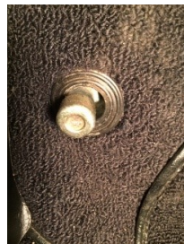
Corvair Dimmer Doohickey?

Then I thought of my Corvair. Story goes that to save a few dollars, GM didn’t install a doohickey that helped stabilize the handling. Boy do times change. I wondered, does the Corvair have ANY doohickeys?