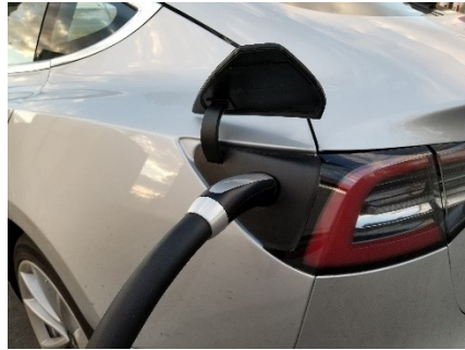
Door to Charging Doohickey

Inside, there is no “dashboard” in the conventional sense but may become the new conventional sense. Instead there is a centrally mounted display panel where all the information from the other doohickeys are displayed. With a touch, one can quickly learn what the other specific doohickeys are doing. It all comes with the cost of the vehicle.